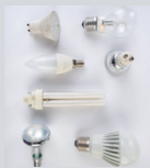
Small light bulbs